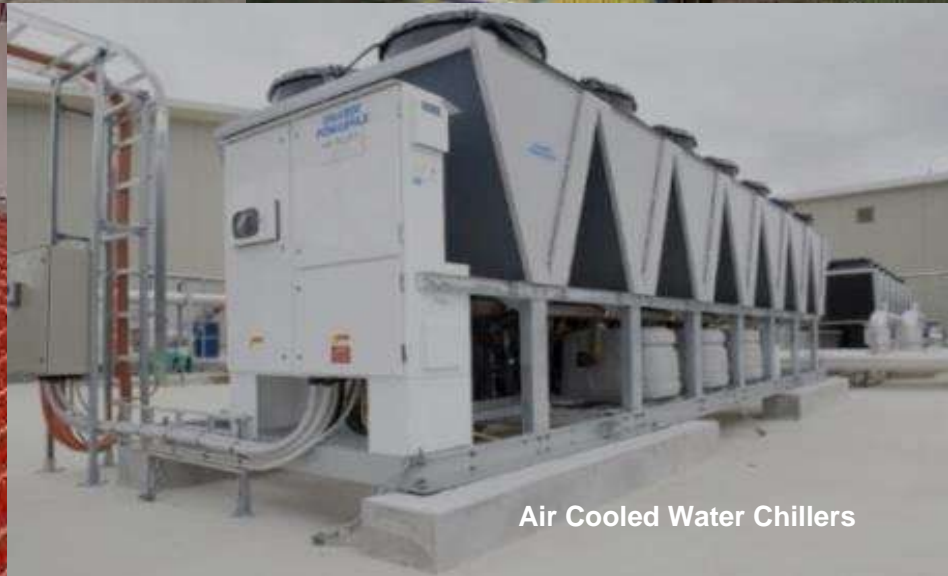
Air Cooled Water Chillers