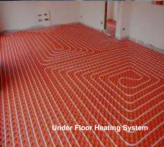
Under Floor Heating System