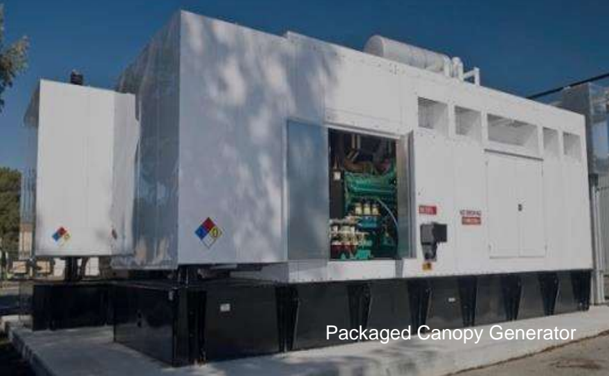
Packaged Canopy Generator