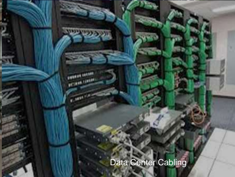
Data Center Cabling