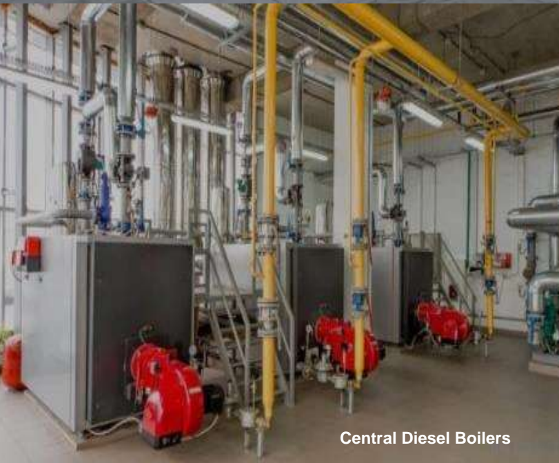
Central Diesel Boilers