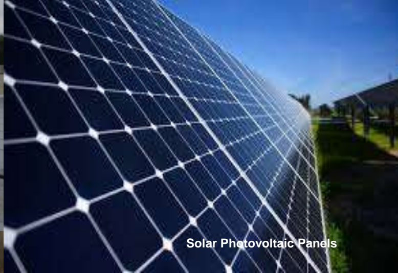
Solar Photovoltaic Panels