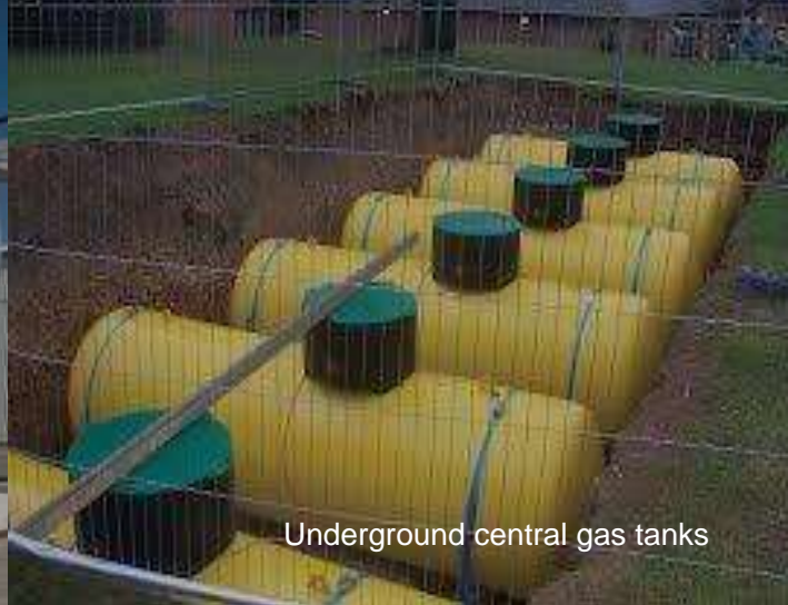
Underground central gas tanks