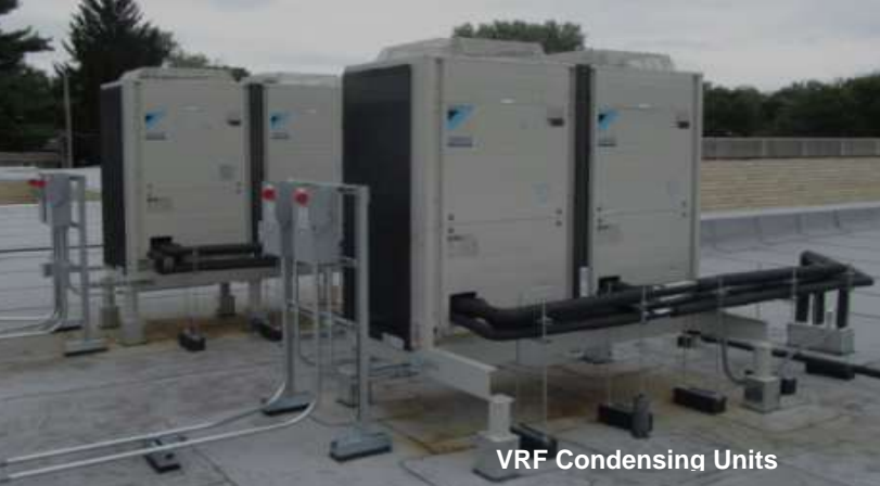
VRF Condensing Units